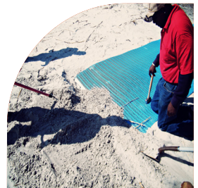
FIG. 3 - COVER ENDS WITH SAND TO PREVENT TRIPPING