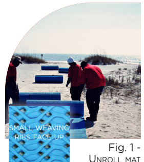
Fig. 1 - UNROLL MAT