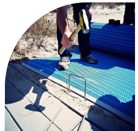
FIG. 2 - ANCHOR THE PATHMAT END WITH U-PINS